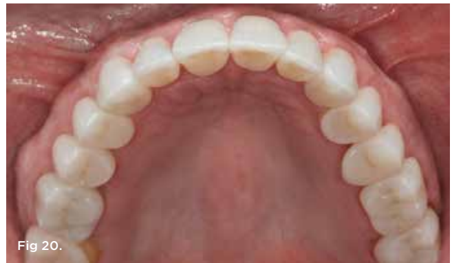
Fig 18. Careful interproximal removal of excess composite material. Fig 19. Light polymerization of composite resin for 60 seconds from each side. Fig 20. Postoperative occlusal view of maxillary arch with full-contour monolithic high-translucent zirconia restorations on all teeth. Fig 21. Postoperative frontal intraoral view in maximum intercuspation with full-contour high-translucent zirconia restorations. Fig 22. Postoperative extraoral view of patient's smile.