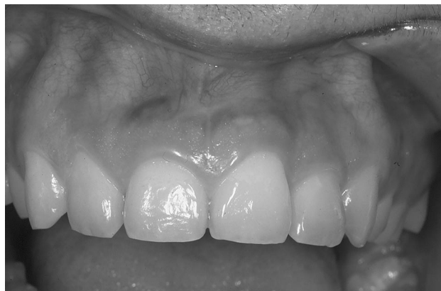
Fig. 1. View of upper anterior segment, showing an upper right central incisor with a short clinical crown due to excess gingival coverage of the anatomic crown, (“altered passive eruption” or “delayed passive eruption”).

enough apically to approximate the CEJ. This ultimately results in short clinical crowns due to excess gingival coverage of the anatomic crown (Fig. 1). This condition is termed “altered passive eruption” or “delayed passive eruption” [10–12].